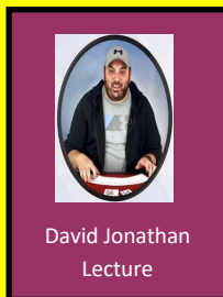
David Jonathan Lecture